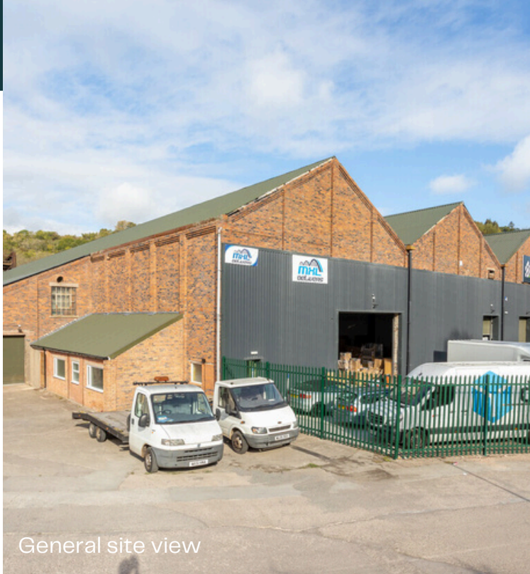
General site view